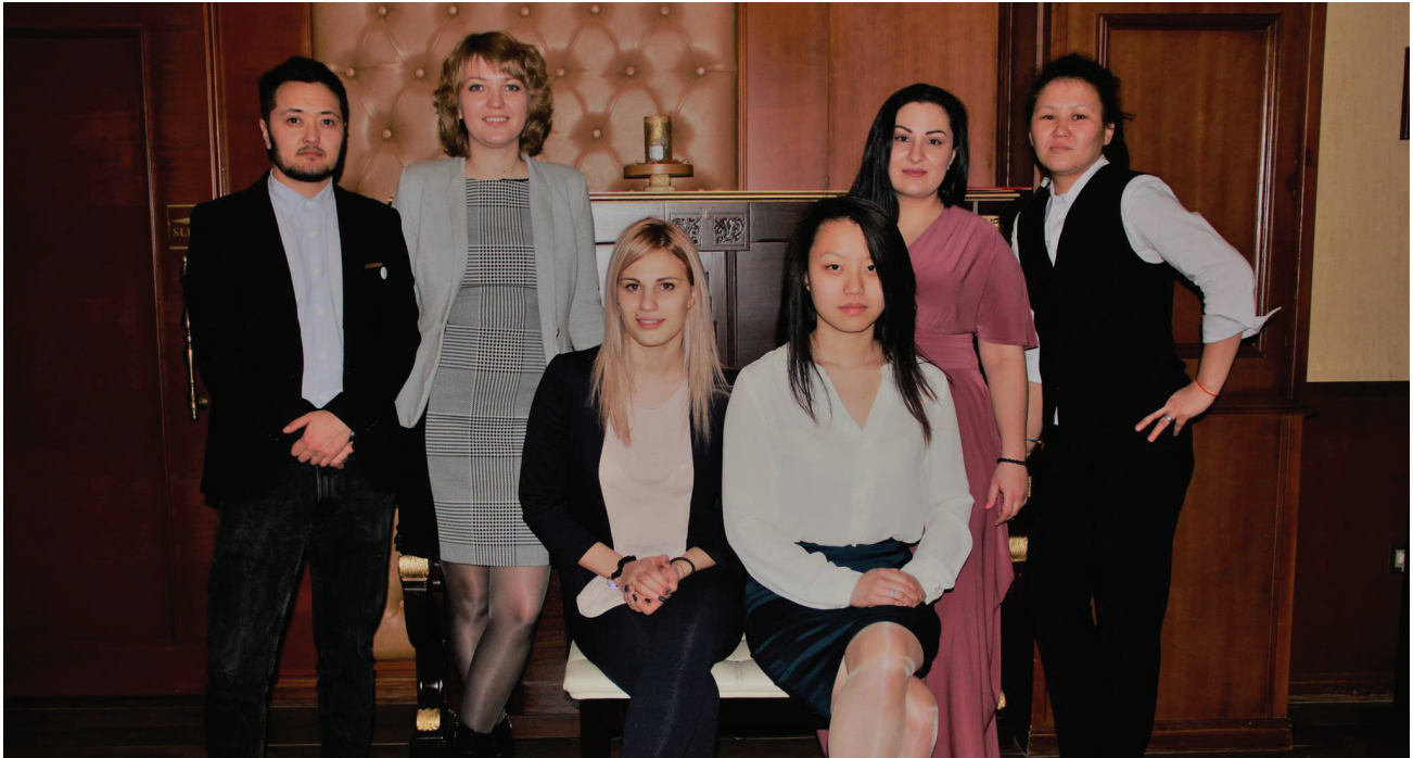
LGBT Organization Labrys Kyrgyzstan on the organization's 13th birthday, 2017.