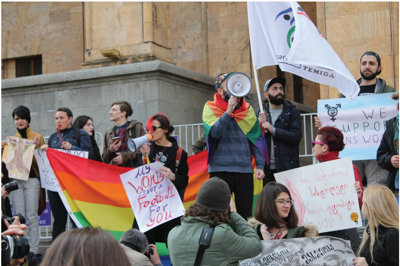
LGBTQI Association Temida, Tbilisi, Georgia, 2017.

In some Central Asian countries (particularly Uzbekistan and Turkmenistan), same-sex acts remain criminalized, with police authorities routinely enforcing the law while humiliating and abusing LGBTQI people. 6