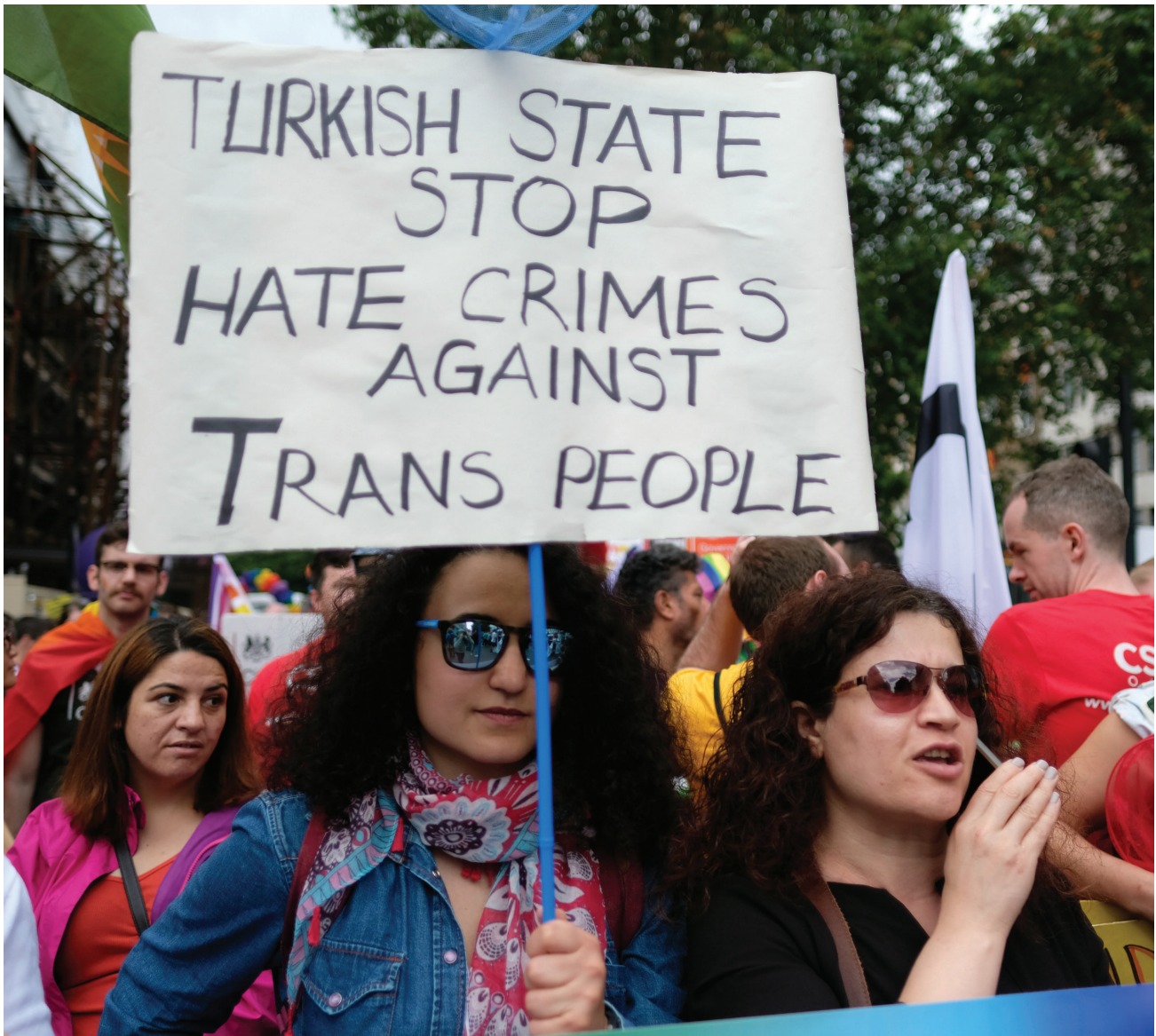
Solidarity with Turkey's LGBT community at the London Pride Parade - 25 June 2016.