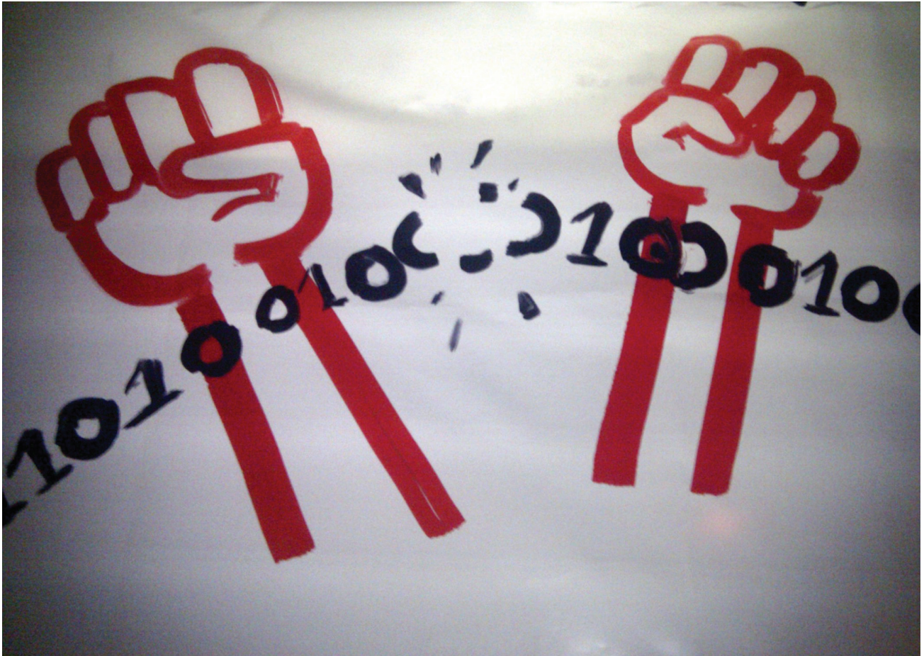
Digital Chains.

from Czech Republic and Hungary with almost 80% of the population having a subscription to the internet to countries such as Turkmenistan (15%) and in Tajikistan (19%) where only a minority of people are connected to the internet.