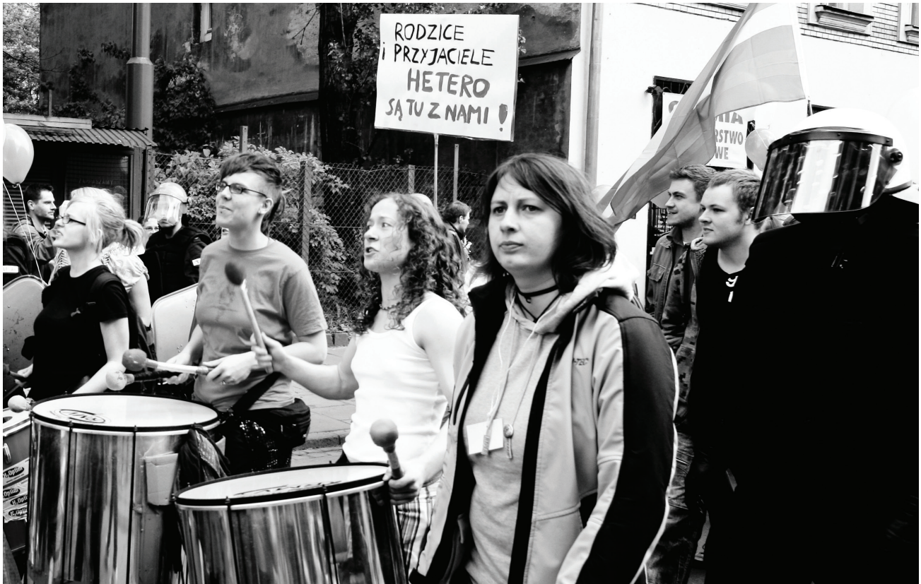
Scenes from a(n) Equality March), Poland, 2011.

studies 14 15 assessed the impact of what is termed the “closing space for civil society” on women’s and trans rights organizing, and this report aims to build on that work and show how these policies curtail access to the most efficient medium of trans activism: the internet.