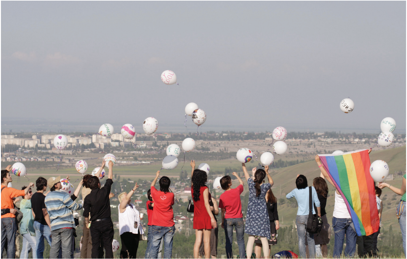
International Day Against Homophobia event, May 17, 2008, Kyrgyzstan.