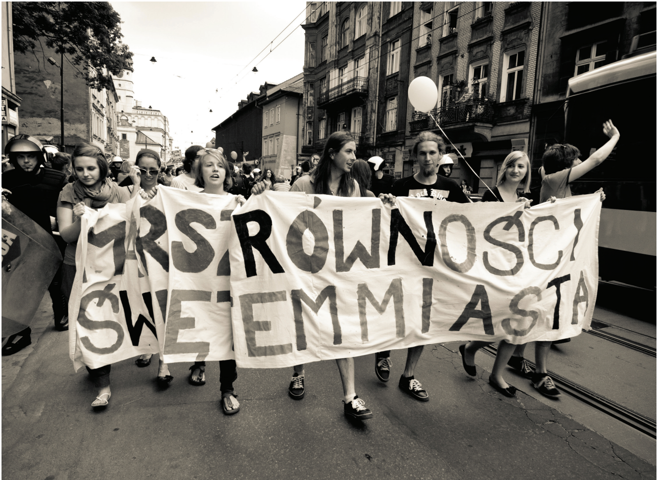
Equality March 2011, Poland.

LGBTQI - An acronym for Lesbian, Gay, Bisexual, Trans, Queer, and Intersex.