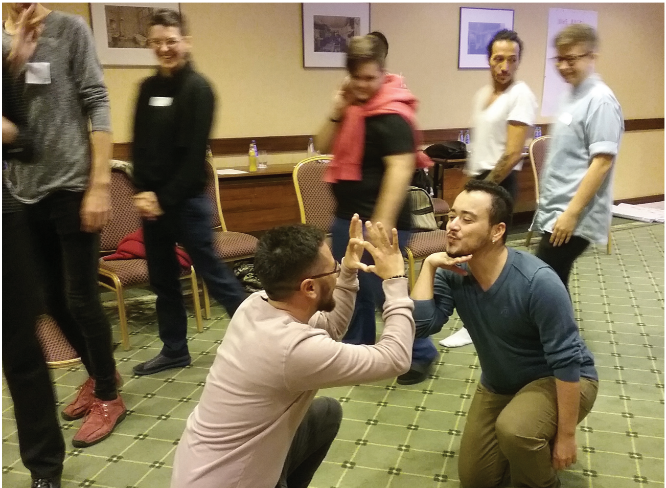
Activists attend a CommsLabs strategy meeting in Warsaw, November 2017.